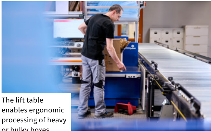
The lift table enables ergonomic processing of heavy or bulky boxes.