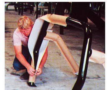
Cro-nel®, roll bar