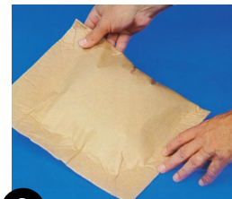
3 Cro-nel®, ready to ship