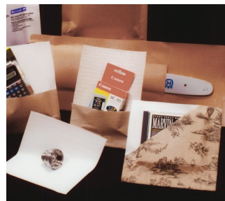
Cro-nel® and Nyvel®, fulfillment