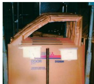
Cro-nel® or Nyvel®, automotive