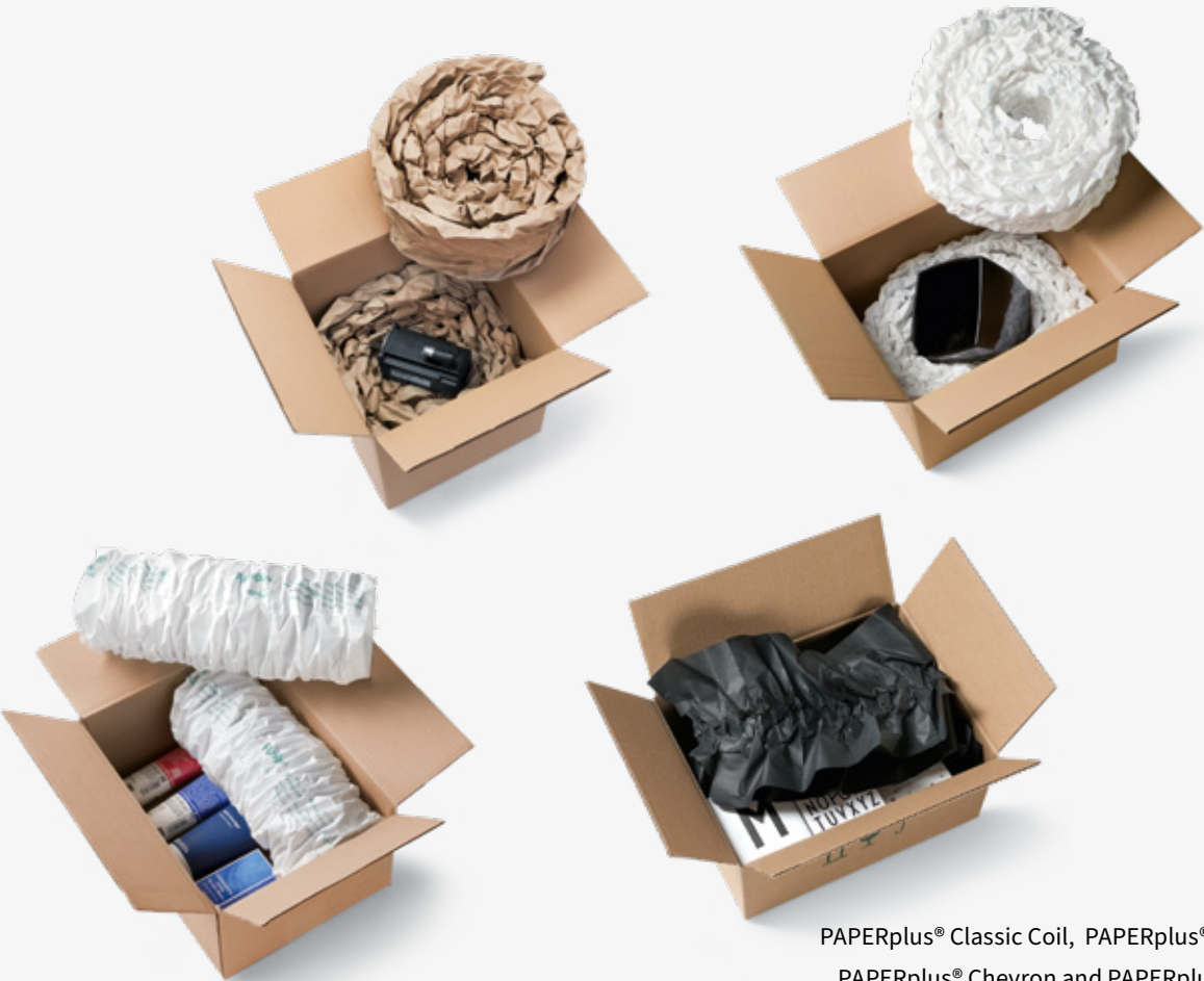
PAPERplus® Classic Coil, PAPERplus® Track Coil, PAPERplus® Chevron and PAPERplus® Papillon