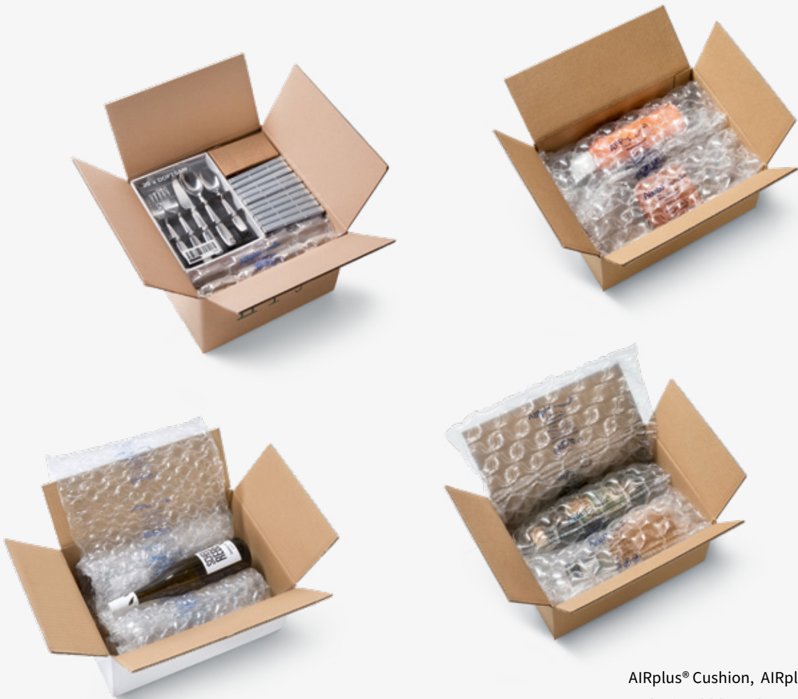
AIRplus® Cushion, AIRplus® Wrap, AIRplus® Bubble and AIRplus® Wrap