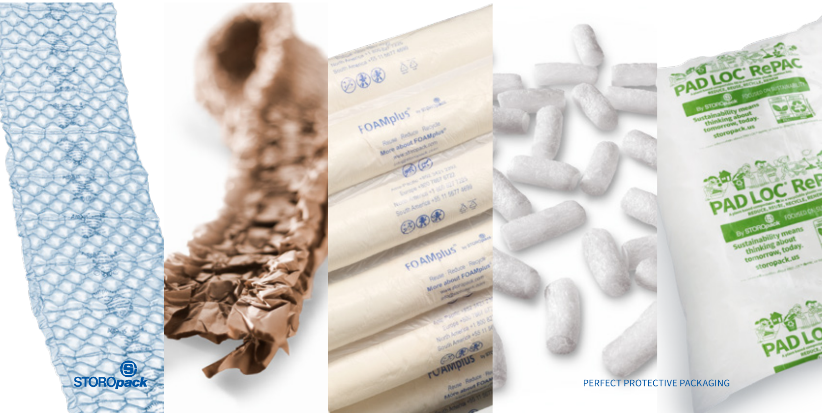
PERFECT PROTECTIVE PACKAGING

Determining a products “fragility level” is quantified and reported in “G’s (G-Force)”. The selection of the right optimal solution will also immobilize the products in the box by “blocking and bracing” them in place thus ensuring a safe transit.