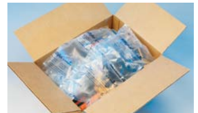
A fast and easy void-fill material, AIRplus® prevents items like small packages of hardware from shaking open in the box.