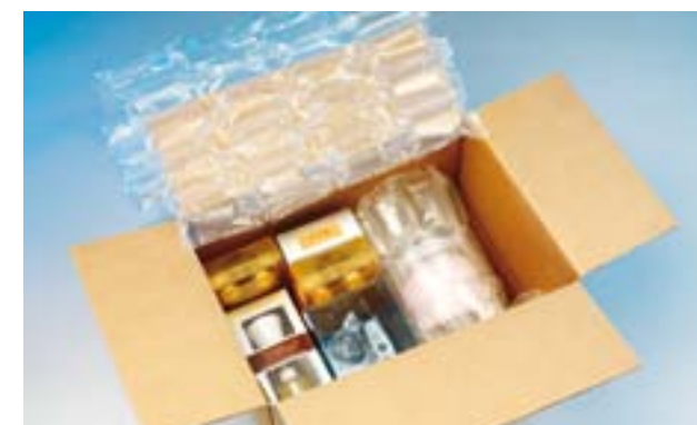
AIRplus® Cushion Film easily wraps around and protects individual unpackaged items such as the candles in this box.