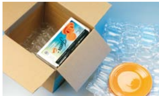
Protect unpackaged china by looping AIRplus® Cushion Film around and between the plates for cushioning.