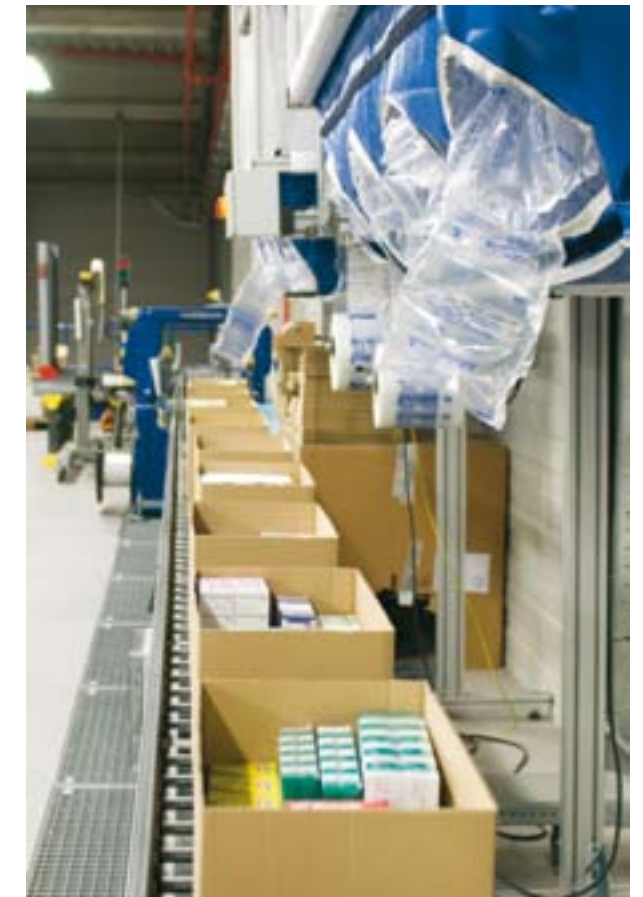
AIRplus® machines keep packing materials readily available by continually filling multiple access storage bins over packing stations.