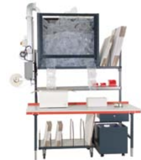
Packaging table with an integrated AIRplus® Mini.