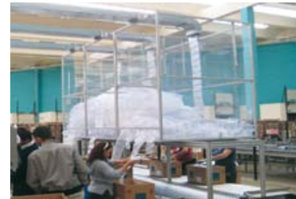
AIRplus® integrated systems continually feed air bags into bins over the packing station for quick and convenient access.