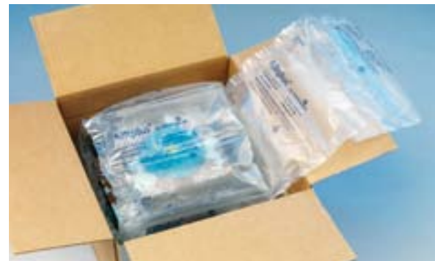
Using AIRplus® CX Film square bags for cushioning protect this gift tower of decorative boxes.