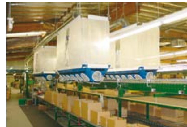
Example of a AIRplus® silo integration.