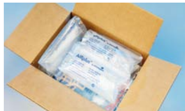
AIRplus® CX Film square bags easily block and brace stacked items such as books.