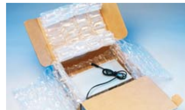
AIRplus® Cushion Film is rolled and positioned around this DVD player giving block and brace protection.