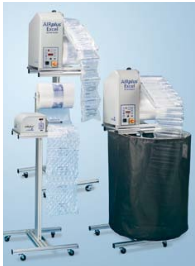
Stands and accessories are available for both AIRplus® models. The AIRplus® Accelerator is a bin with a built-in photoeye that continually checks bag accumulation and automatically initiates production when inventory drops below a certain level.

Storopack AIRplus® machines are fast, compact, portable and extremely easy to operate. All AIRplus® models are completely programmable, offer quick and easy loading, and are among the most reliably built in the industry. With their small footprints and large production capacities they fit easily into any packaging environment — regardless of volumes. In addition, AIRplus® offers optimum flexibility with multiple packaging options including our comprehensive line of AIRplus® film products, convenient production enhancing accessories and Intelligent Delivery System and integration options.