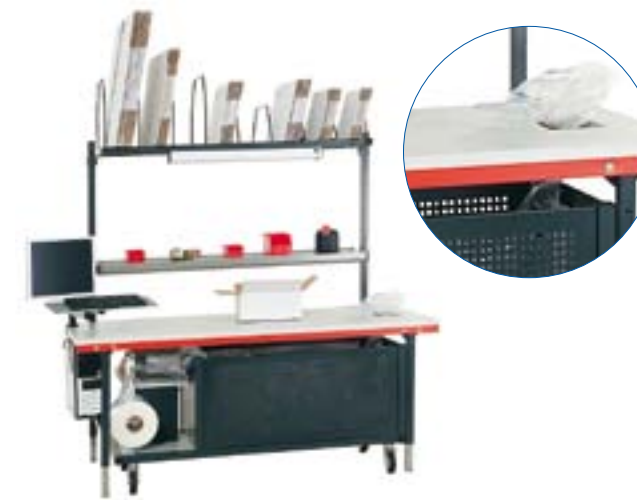
Standard single packing table with AIRplus® Mini feeding inflated Void Film into a convenient dispenser.