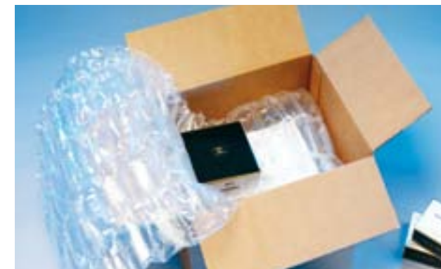
AIRplus® Cushion Film acts as void fill to protect expensive consumer packaging.